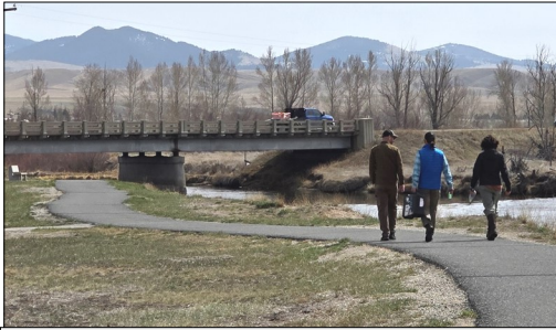
Arrowstone Park is safe to visit, but follow signage and use caution around exposed soil

As of June 2025 the MT Dept. of Environmental Quality (DEQ) is producing a plan for additional sampling - essential for cleanup design - to fill gaps from previous sampling. Those gaps include sampling at depth in areas where only surface sampling was done before; sampling with more sensitive equipment than was available during previous sampling; and sampling new areas where DEQ did not previously have access.