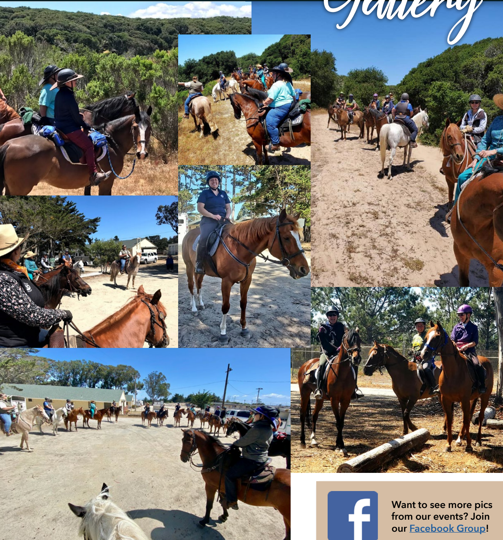
We had a wonderful large group (16!) for the Fort Ord ride.