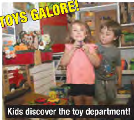
Kids discover the toy department!