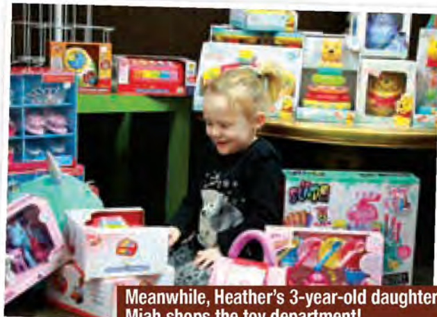
Meanwhile, Heather's 3-year-old daughter Miah shops the toy department!

Emergency Alert: Electronics necessities at a fraction of retail prices!