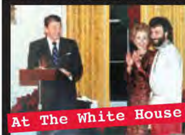
At The White House!