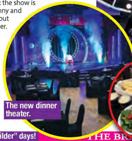
The new dinner theater.