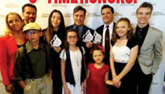
Stars of the Hughes Family Show pose with their honors at The 2019 Branson Show Awards!