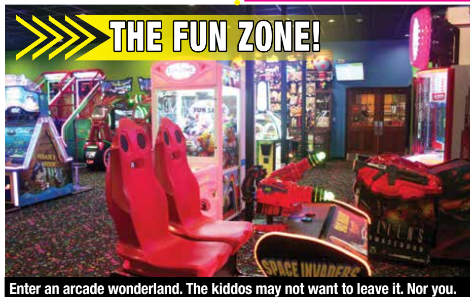
Enter an arcade wonderland. The kiddos may not want to leave it. Nor you.

Branson: 1464 State Hwy. 248 Springfield: Battlefield Mall