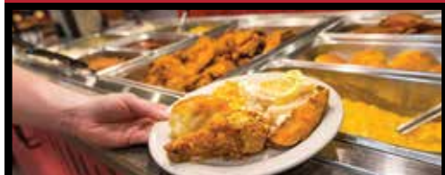
Critically acclaimed chicken!