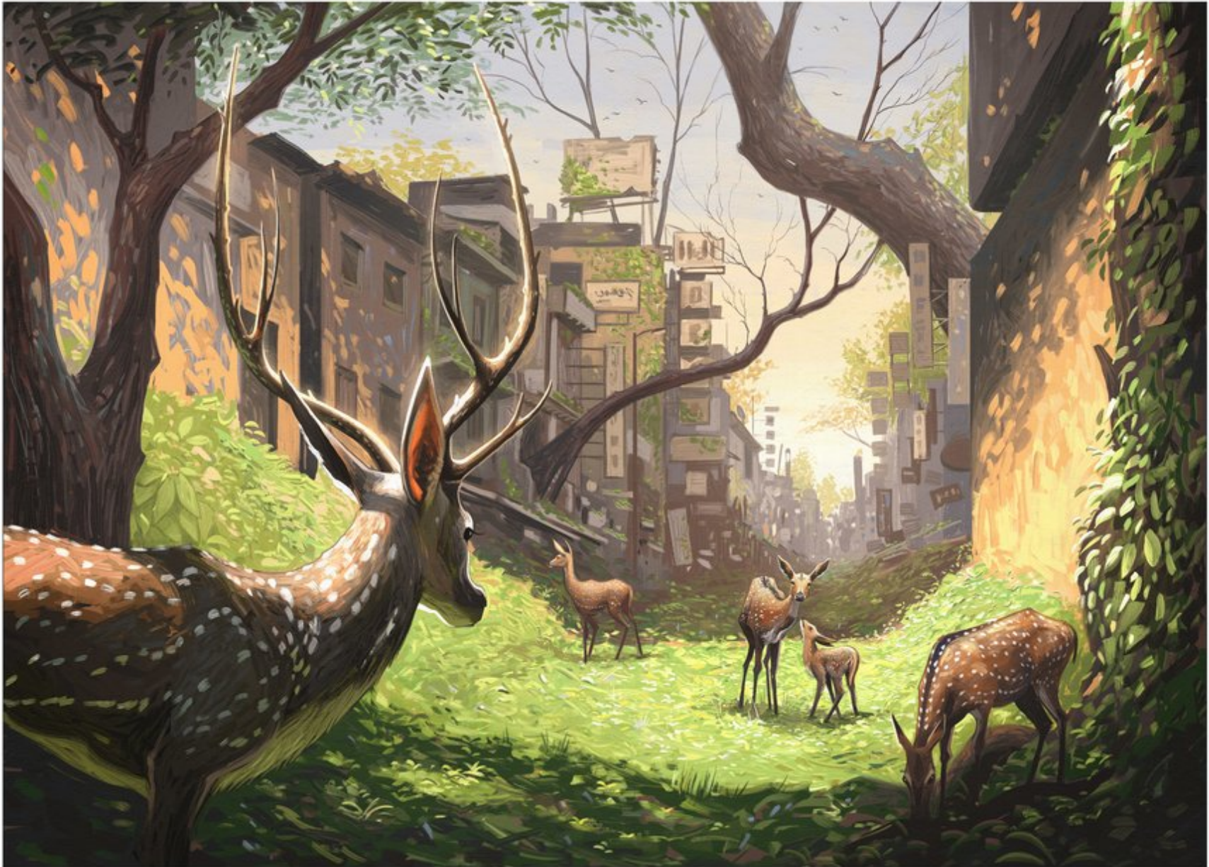
In the land where the spotted deer live