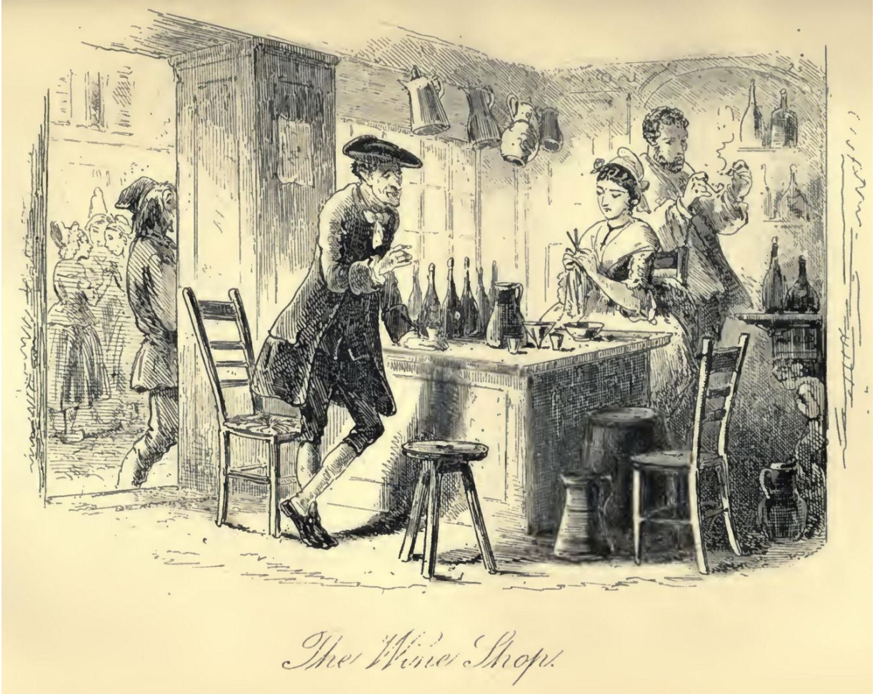
The Wine Shop.