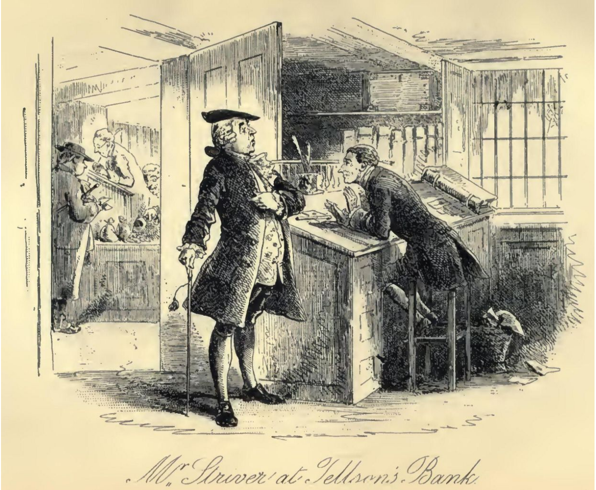
Mr. Grover at Tellson's Bank.