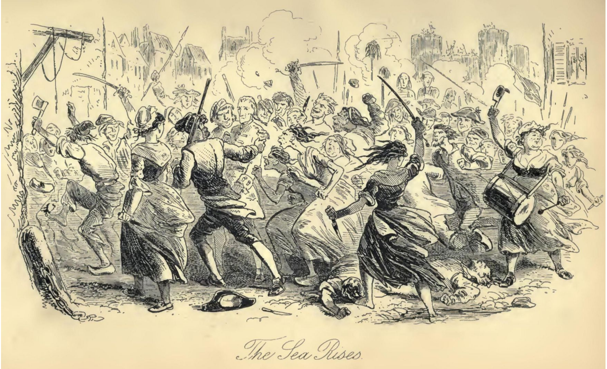
The Sea Rises.