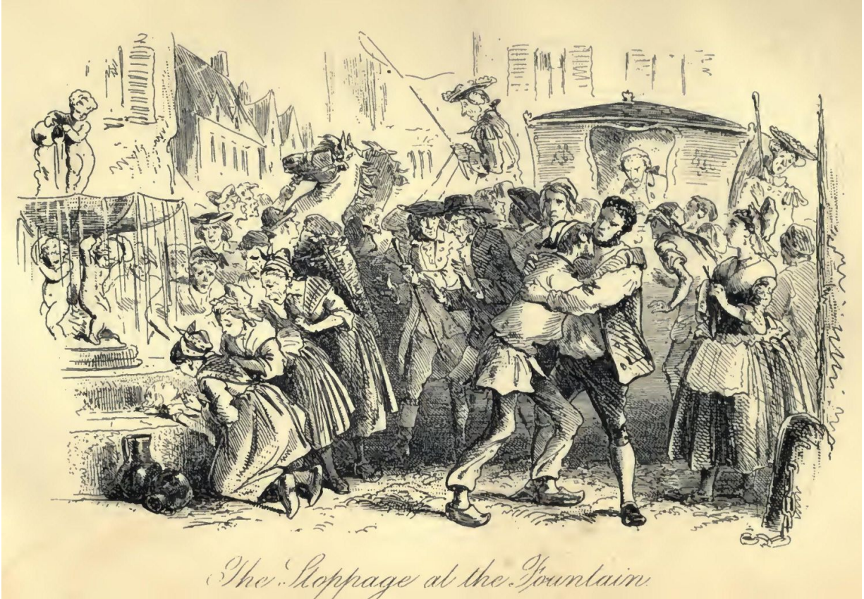
The Stoppage at the Fountain