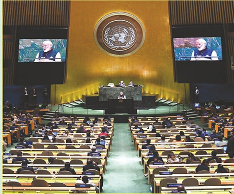
Prime Minister Shri Narendra Modi addressing the 74th session of the United Nations General Assembly (UNGA), in New York, USA on September 27, 2019