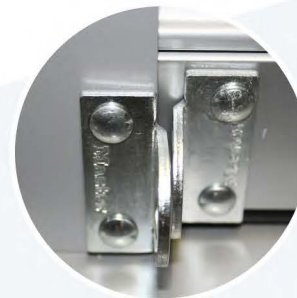
Bottom locking hasp