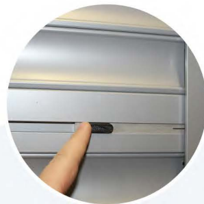
Finger slide bolt