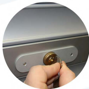
Bottom slat lock Intermediate slat lock

With several different locking options, you can get the level of security you need. 5 Year Parts Warranty