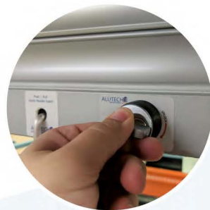
HD commercial lock thumb or key - 7pin