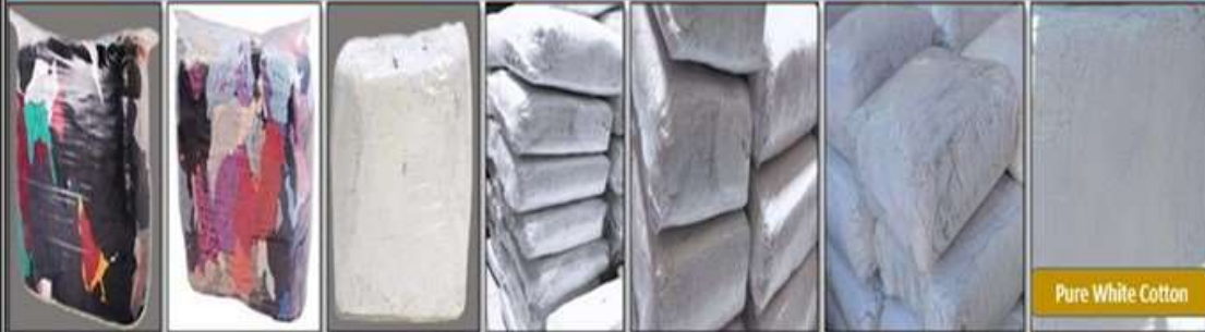
Pure White Cotton

We Offer Wide Range of Packaging & Protection Items