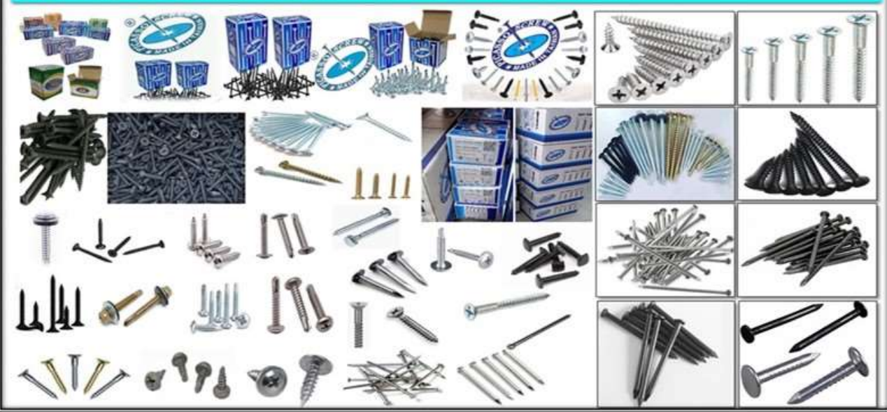
Wide Range of Screws & Nails Used in Various Construction Activities