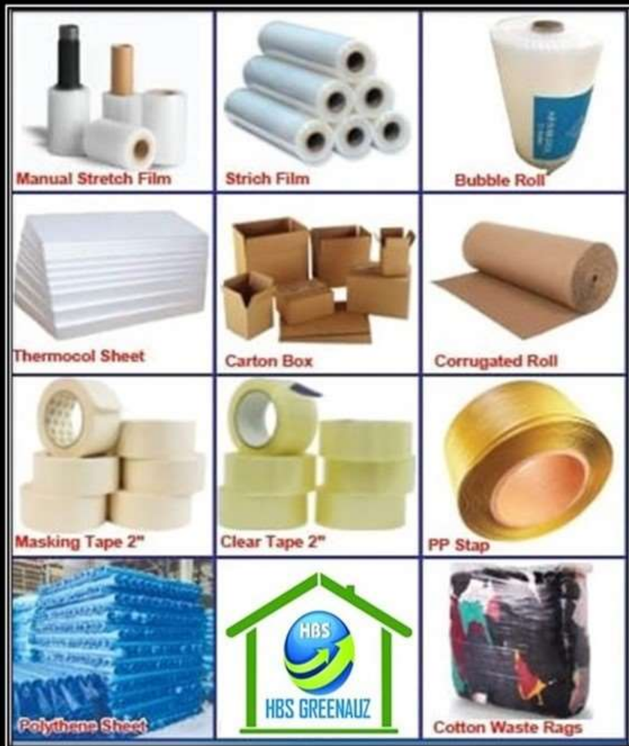
Manual Stretch Film