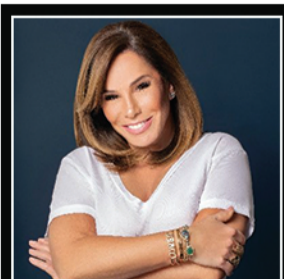
Ep. 97: Melissa Rivers TV Personality/Podcast Host