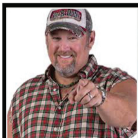
Ep. 46: Larry the Cable Guy Stand-Up Comedian Blue Collar Comedy Tour