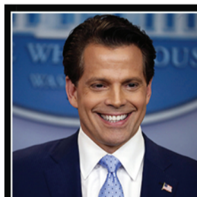
Ep. 52: Anthony Scaramucci Ex- White House Communications Director