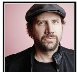
Ep. 83: Jamie Kennedy Actor/Stand-Up Comedian