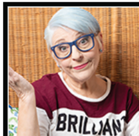
Ep. 130: Lisa Lampanelli Stand-Up Comedy Legend