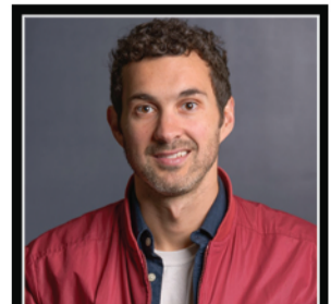
Ep. 101: Mark Normand Stand-Up Comedian