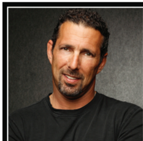
Ep. 67: Rich Vos Stand-Up Comedian