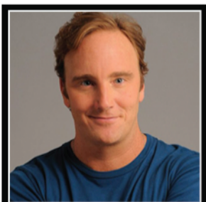
Ep. 90: Jay Mohr Stand-Up Comedian / Actor