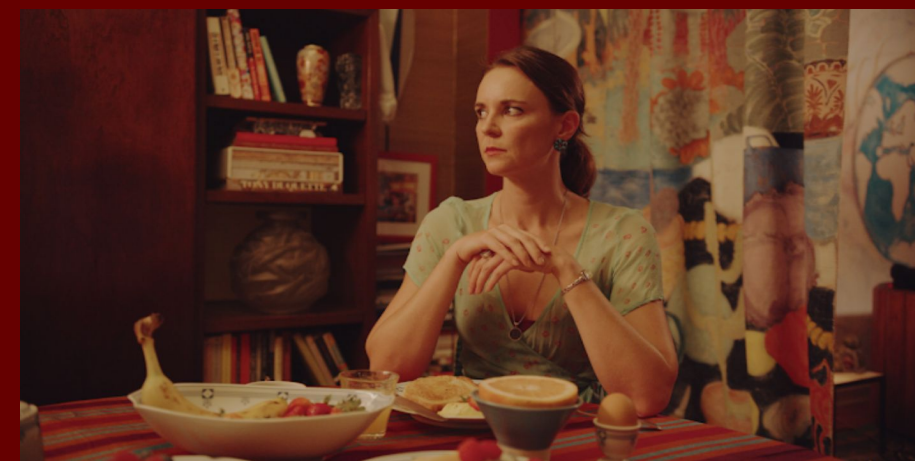
THE SISTERS KARRAS