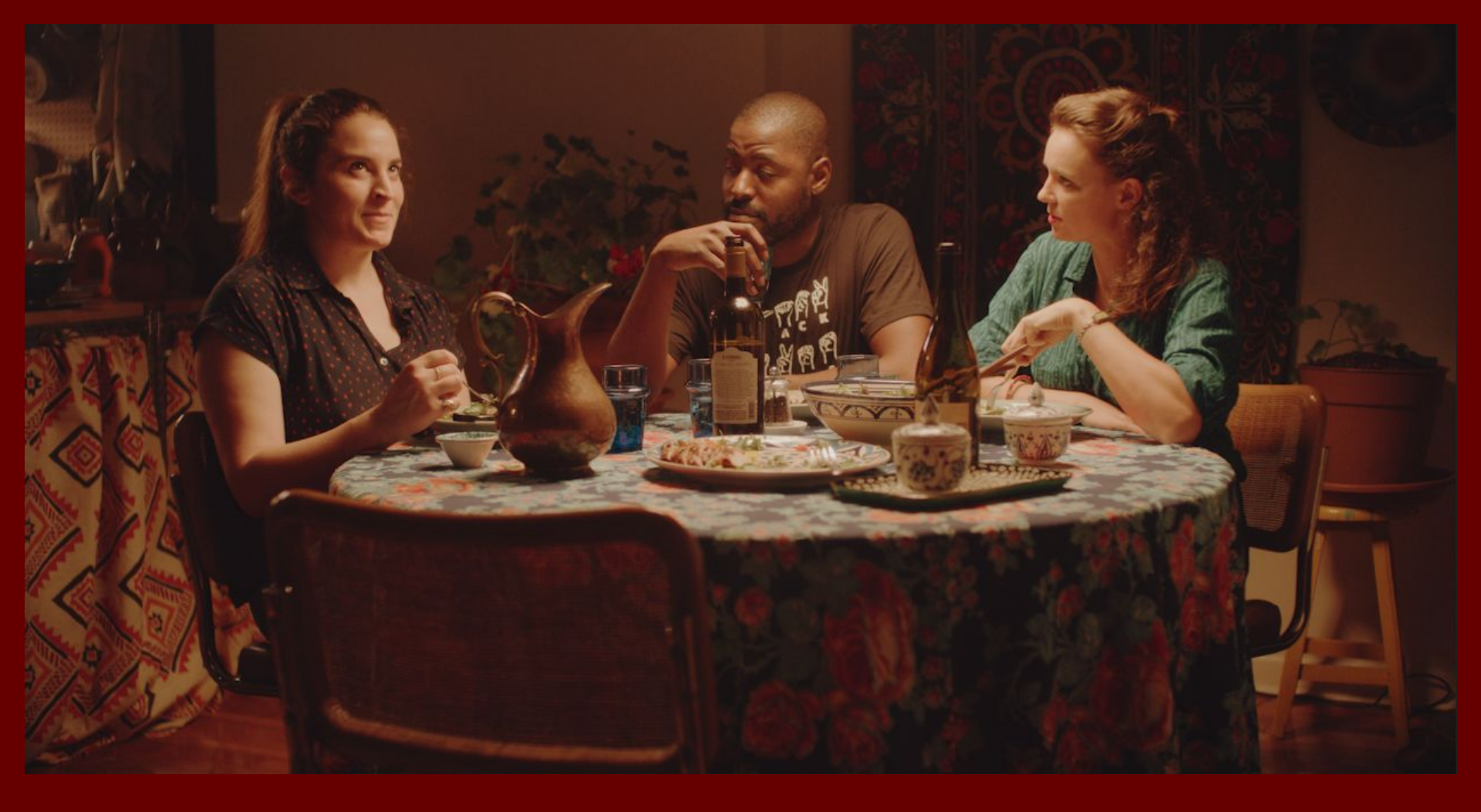
THE SISTERS KARRAS