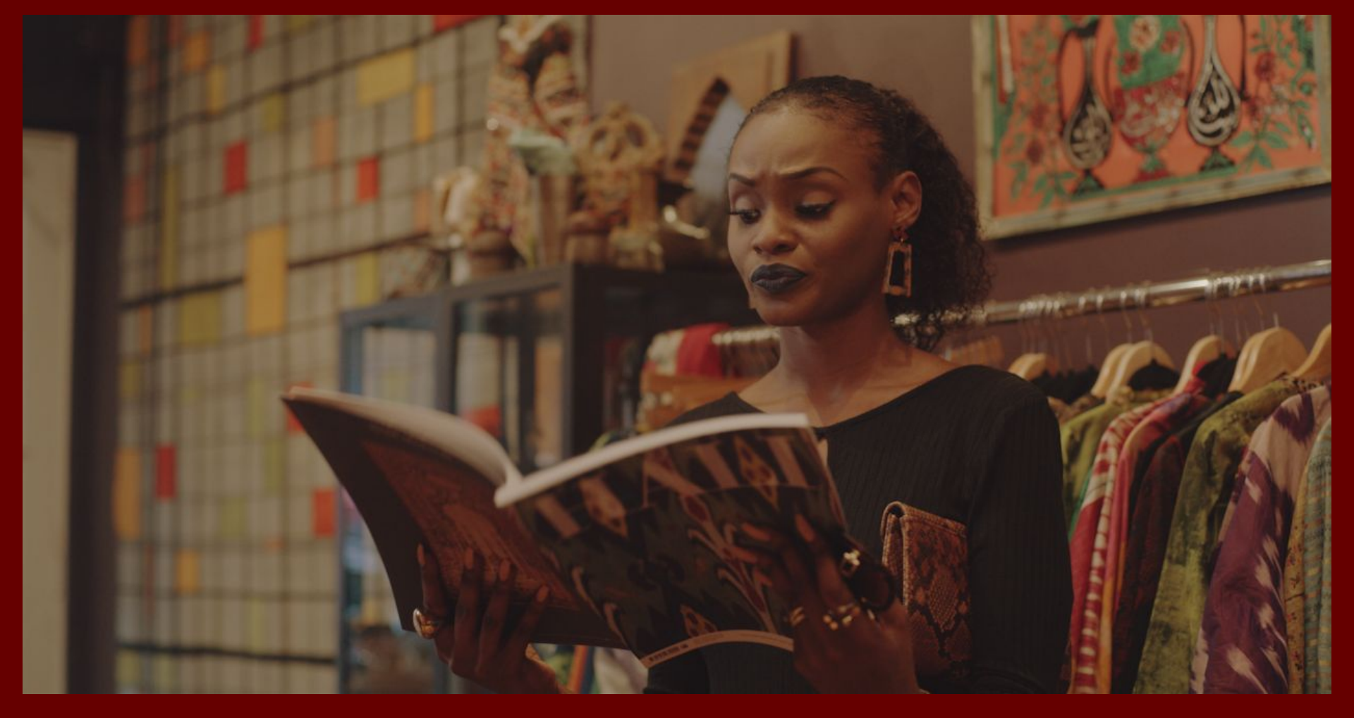
THE SISTERS KARRAS