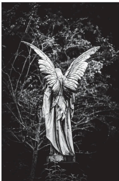
LUMEN DE LUMINE Requiem

Lumen de Lumine requiem for chorus, organ and strings learn more