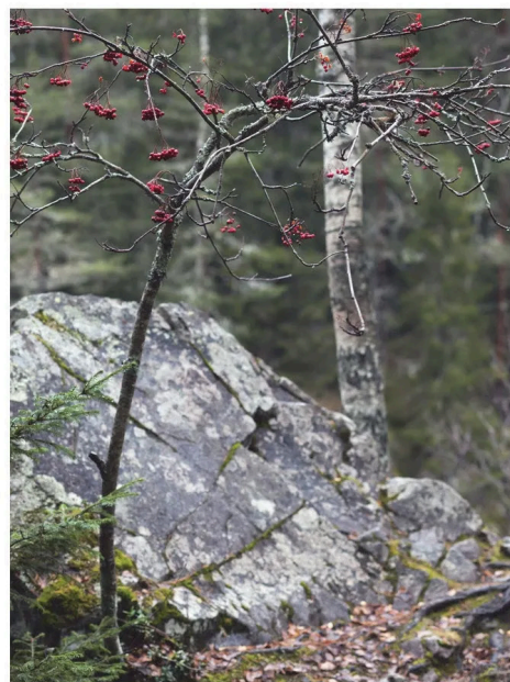
Rowan Tree for organ and voices

Rowan Tree five anthems for holy week organ and voices learn more