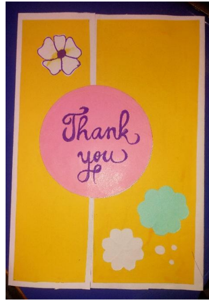
Children created this card to thank supporters at Shared Blessings