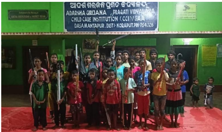
Just in time for the monsoon season, all children received umbrellas