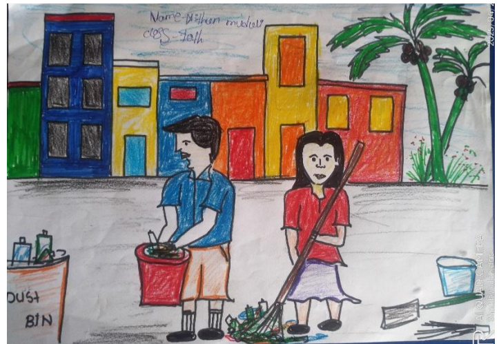
Message from a budding artist