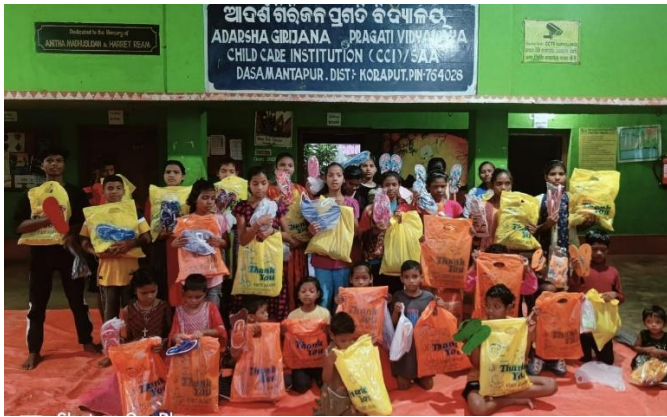
School year started with new clothes..