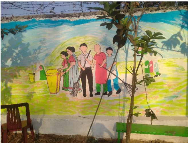
Wall painting with message

Chicken coop is almost ready.. The building needs to be secure from foxes, snakes and wild dogs!