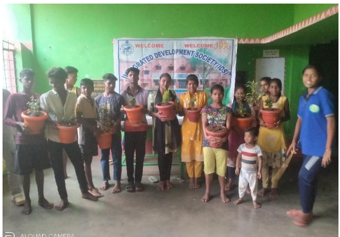
Planting Trees project