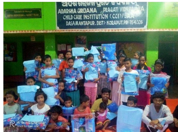
and netting for bed to keep mosquitos out