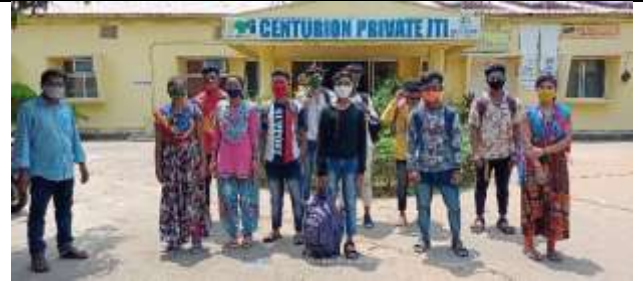
Trade School Children returning home after declaring Govt. to vacate the school in view of COVID-19 pandemic