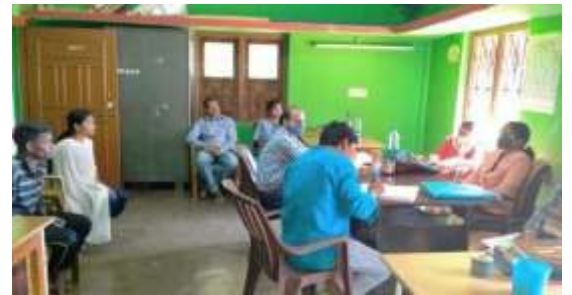
District Inspection Committee(DIC),Koraput visit to AGPV and CCI