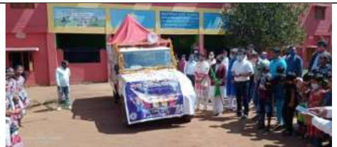
Sisu Sampark YATRA was inaugurated at AGPV Premises by Judicial Magistrate First Class on March 3, 2021