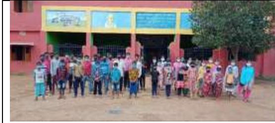
Children in AGPV School during Pandemic Period