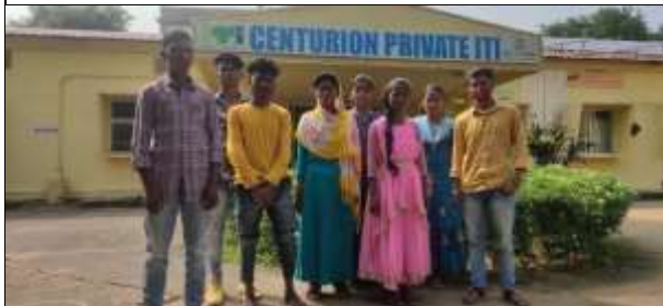
Children those who joined Trade School in 2021