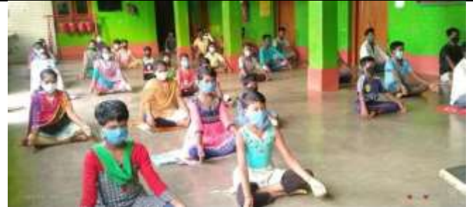
Children are practicing YOGA