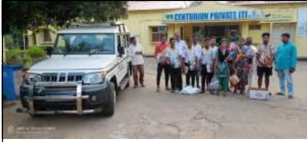
Children at Trade School during follow up visit