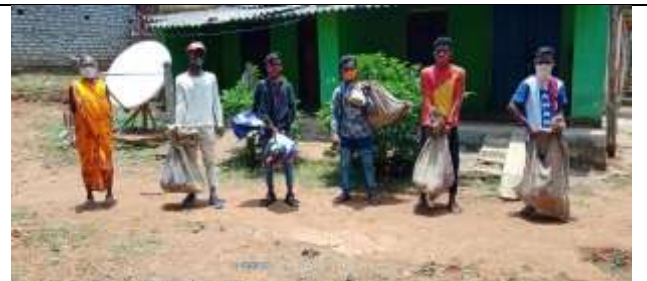
Children/Guardians receiving dry food/material during Covid-19 Pandemic