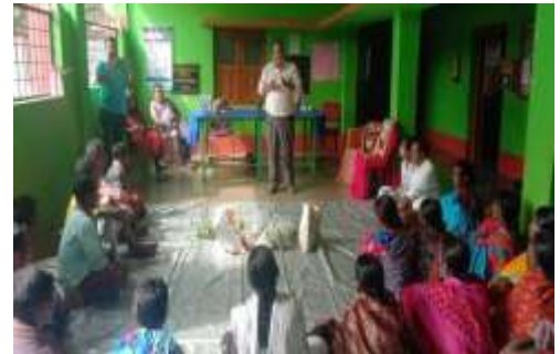
Parent and Guardian meeting was organized in AGPV premises in Jan 2021