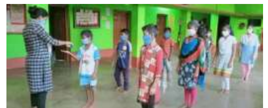
Hand wash practice by the Children