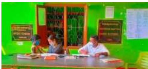
Health Check up to the Children by Local CHC Doctor