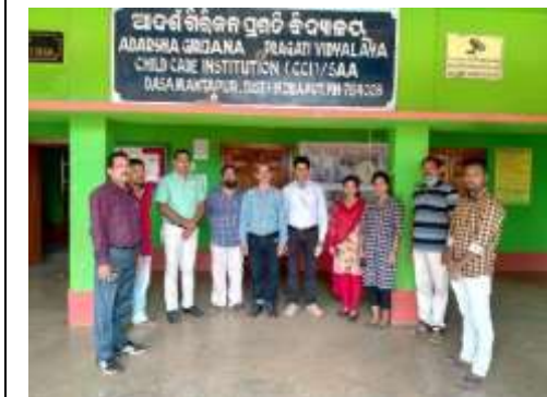
Visit of Programme Manager-SARA to AGPV/CCI