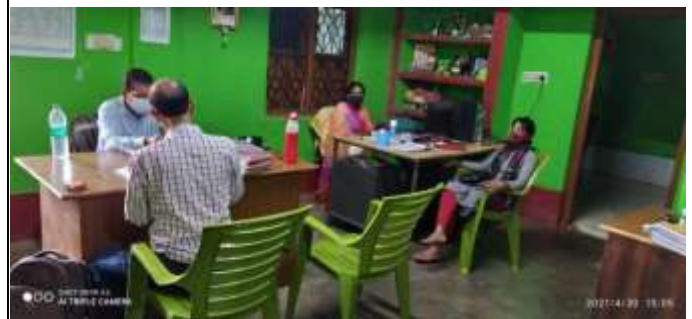
Home Management Committee Meeting on April 30, 2021