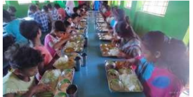
Children in AGPV are enjoying food sitting on Dining Table.