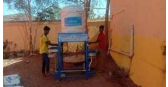
New hand wash station installed in AGPV campus