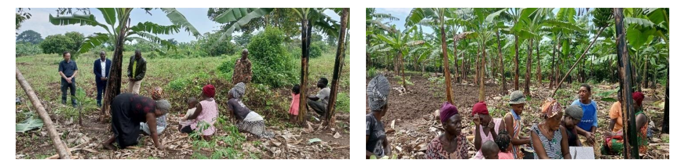
The pictures above one SHG group that has engaged in farming project mostly Matooke growing, during aspecial on site training

During our visits, we discovered that as much as they carry out crop husbandry, there's need for subsistence farming with improved farming skills. The gardens also need to have fertilizers to help with better yields. Marketing for the harvested crops is also another.