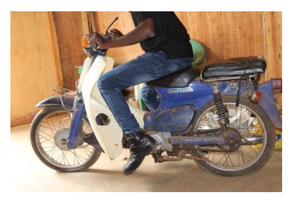
The Honda 50 STD motorcycle which was donated to thevocational department has been used for training purposes and reaching outto the community.

One of our partners donated a motorcycle to the MV department for students to learn how to repair motorcycles and also to help in the transportation of instructors around the community.