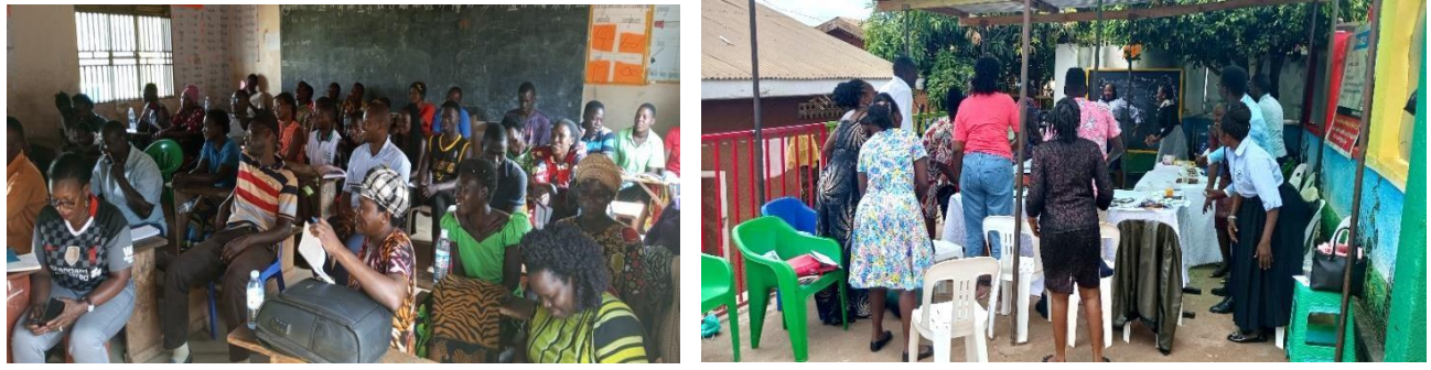
Training of community leaders on conflict resolution and above training of farmers trained in the basic improved farming practices.

We have managed to engage different Rotary clubs, schools, community leaders and otherorganizations in participation, safe guarding and community development through areas of Agriculture, water, child development and conflict resolution in the villages and schools of Makukuba