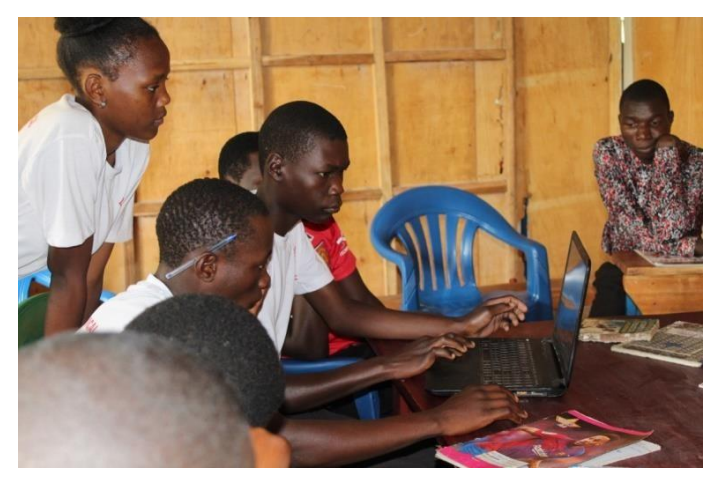
In the picture, are some of the Vocational students carrying out a practical exercise during an information computer technology (ICT) class. There are usually 7–8 learners per computer during studies and we have to borrow from other departments to reduce on the congestion.

Motor – Vehicle Mechanics students have been having study trips to Nakifuma every Monday and Wednesday as a way of supplementing their studies. 90% of the MV learners have been going to Nakifuma with a few missing on some occasions due to lack of transport fees.