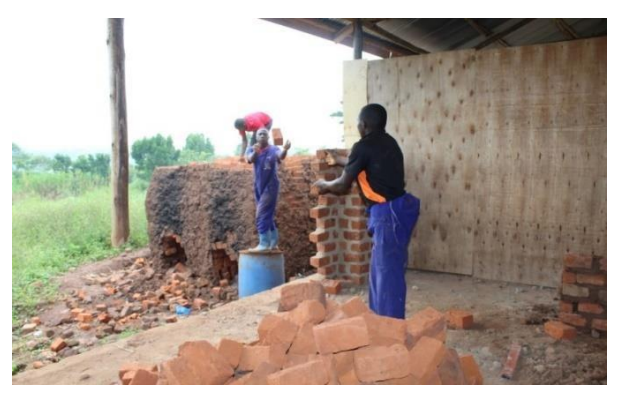
BCPL earners harvesting their baked bricks at the department. These are needed as a standard during examinations

The now 9 students of BCP have been able to produce baked bricks with support from vocation funds and community members. About 4,000 bricks were baked and can now be used during classes