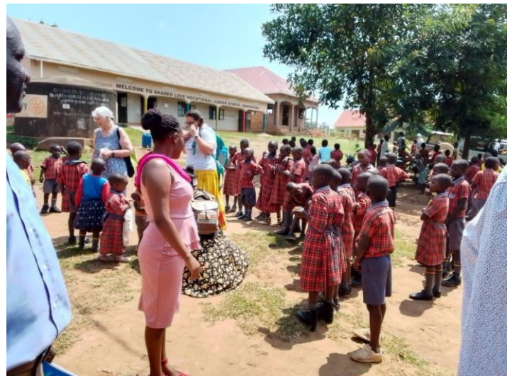
In the pictures are leaners from the Junior school welcoming