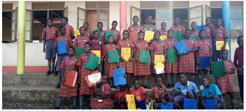
In the pictures is the new students leadership after the

At the junior school still, learners went to the polls to decide on their leaders through a competitive elections which were conducted by the learners themselves so as to achieve fairness. . elections.