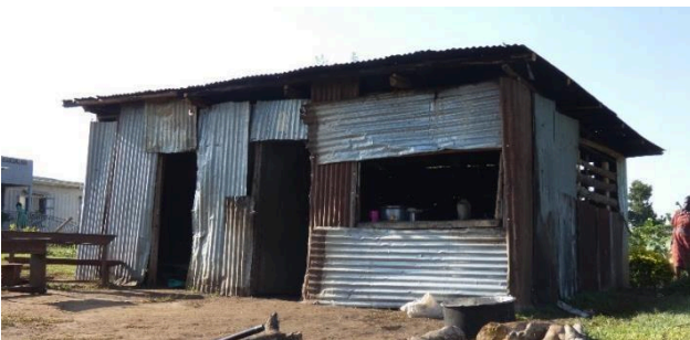
The kitchen before

From the old heating iron sheets that were raised as a temporary kitchen and under the trees dining era, to the new permanent kitchen with dining hall, for the staff and children we are so thankful.