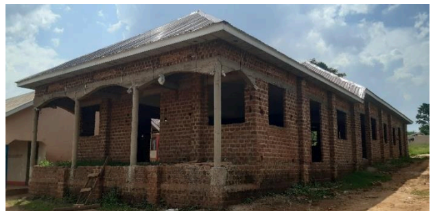
The kitchen currently under construction.