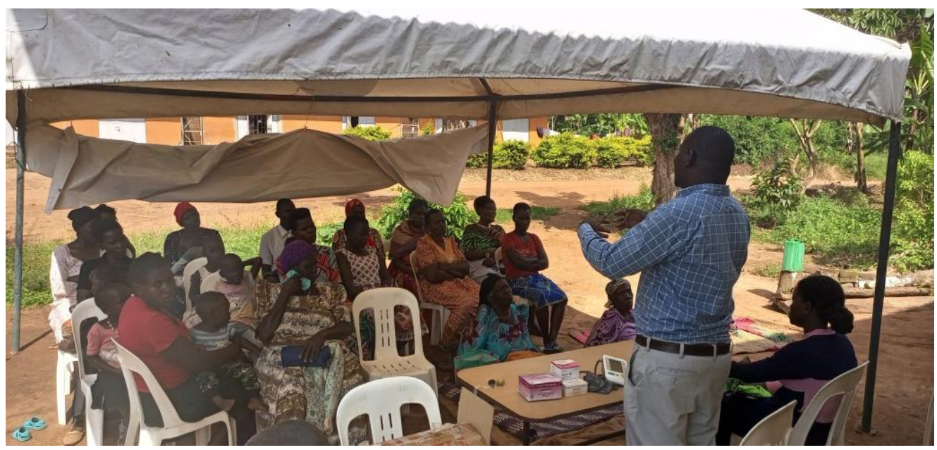
The images above show special health sensitization sessions held both at the health center and in the community.