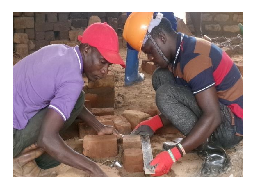
in the picture is a BCP training sessions.

Normal classes are on — going and the training is gaining momentum each day. However, the BCP department faced a challenge of instructors but this has been worked upon after the recruitment of part time instructors and there is a great improvement.