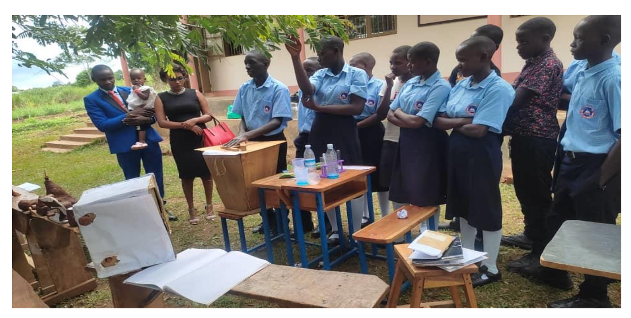
In the pictures are some of the secondary school students during outside class lessons.

Before the official opening of the first term, the school opened on 2<sup>nd</sup> January, with enrolment of teachers and students in S.I and S.2 classes. And on the 6<sup>th</sup> February 2023 at lest 3 students were able to report for classes on first day and am proud to report that numbers have since kept growing to a total of 24 students by the end of March 2023.