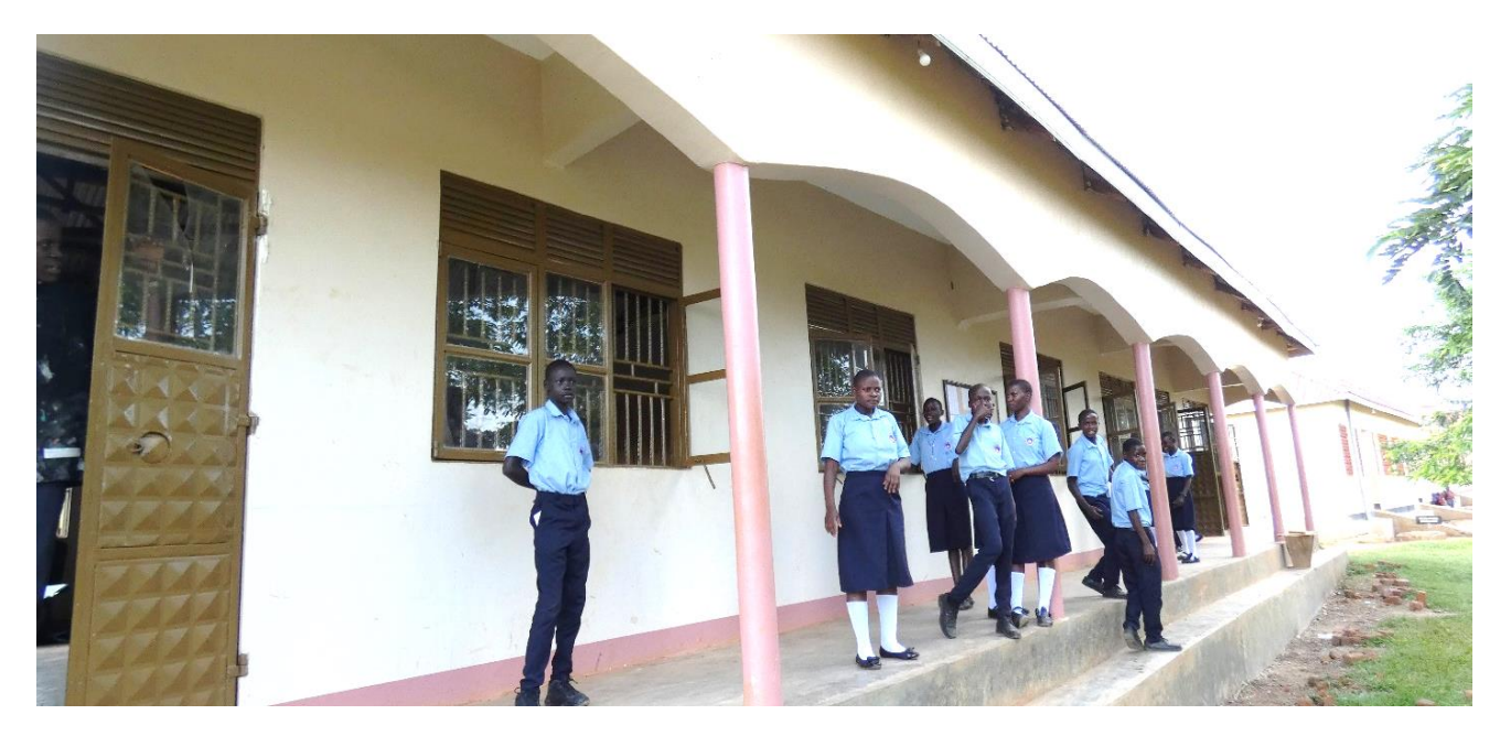
In the picture is the sides view of the high school.

We started the year with preparations for the opening of a new school year and mostly for the opening of our own high school section in Makukuba.