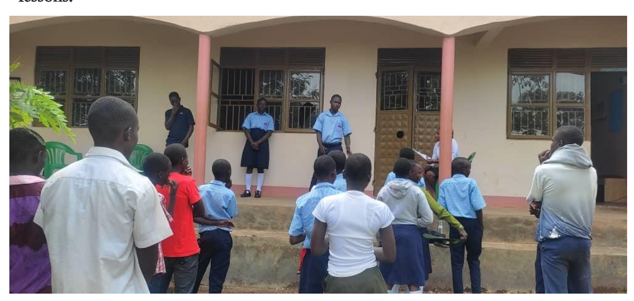
In the picture above, are students during the morning assembly.