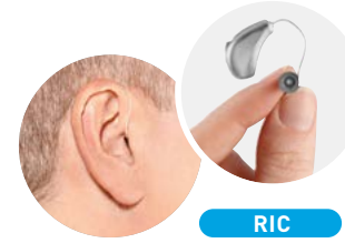
RIC MICRO RECEIVER-IN-CANAL

The RIC and Micro RIC devices are small, discreet and incredibly quick to fit; perfect for many first-time wearers.