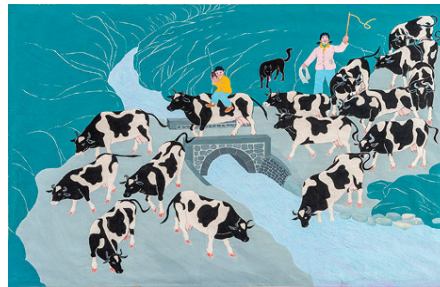
Chaoming Feng, Grazing Cows, 1985–1991, tempera on paper, 23x34 1/2, private collection. © Chaoming Feng.

3. Folk Art from the Shaanxi Region, through Oct. 18. Explore China's past through beautiful, handmade objects and art to gain and understanding of the people.