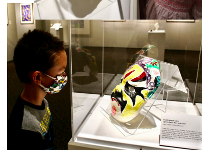
Kids sporting masks check out the masks in the Vibrant Bounty exhibit.

If the museum is closed due to COVID-19, enjoy a virtual visit at littletongov.org (click City Services > City Departments > Museum), Facebook or Instagram.