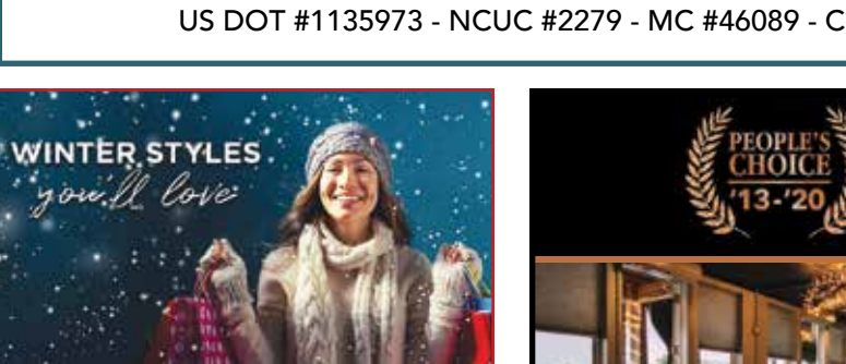
NEW YEAR, NEW STYLES. ALL AT DISCOUNT PRICES MISSES, JUNIORS, PLUS, MEN'S & SHOES