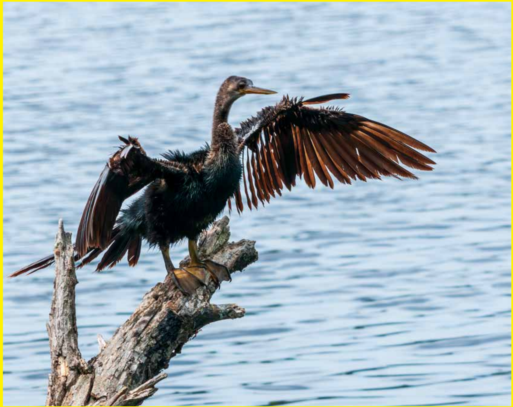
Greg Bias: SC State Park