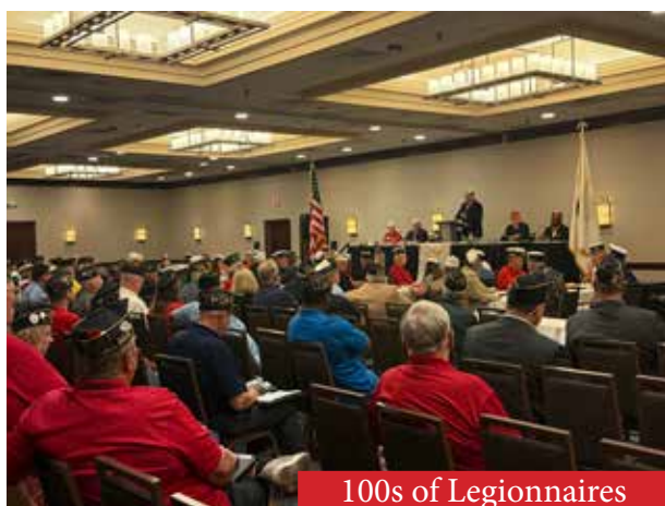
100s of Legionnaires attended NC Convention