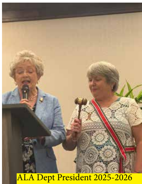
ALA Dept President 2025-2026