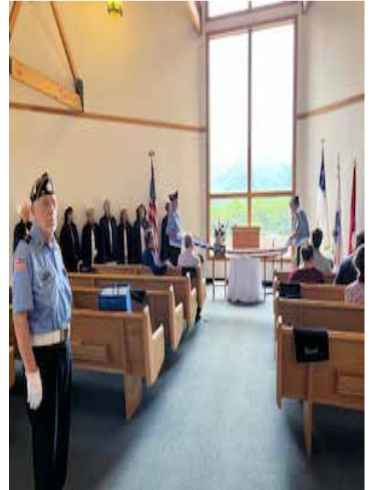
Dual burial ceremony provided by Post 77 Honor Guard