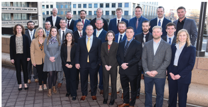
2025 Leadership Institute class.