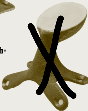
Mexican 2" Caps to 4" Caps•