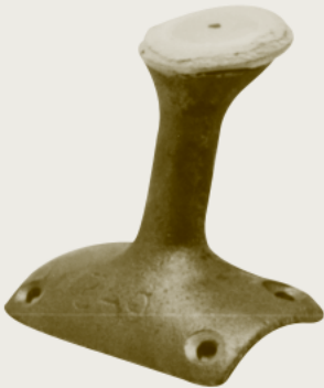
#6-2" Cap 3 1/2" High* #7-2" Cap 3 1/4" High* #8-2" Cap 3 3/4" High*