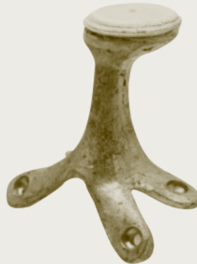
Duckbill 2" Cap 3" High* 2" Cap 3 1/2" High*