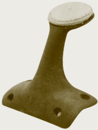
Regular Dally #2-2" Cap 3 1/2" High• #3-2 1/4" Cap 4" High*