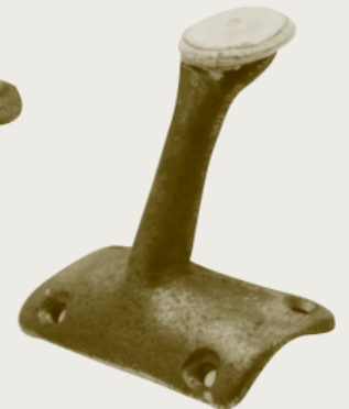
Barrell or Cutter BR 1 1/2" Cap 3 1/2" High•✓