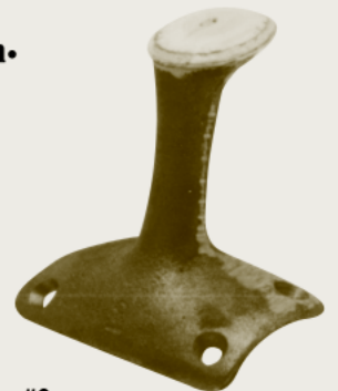
#9 1 1/2" Cap 3 1/2" High*•✓