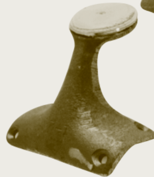
Pleasure Boy 1 3/4" Cap 2 3/4" High• #1-2" Cap 3" High•