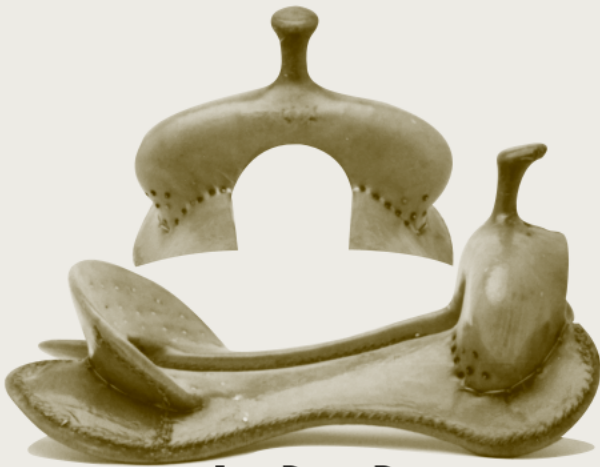
Low Down Roper