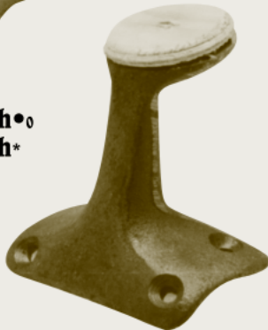
Texas Dally 2 1/4" Cap 3 1/2" High* 2 1/4" Cap 4" High*