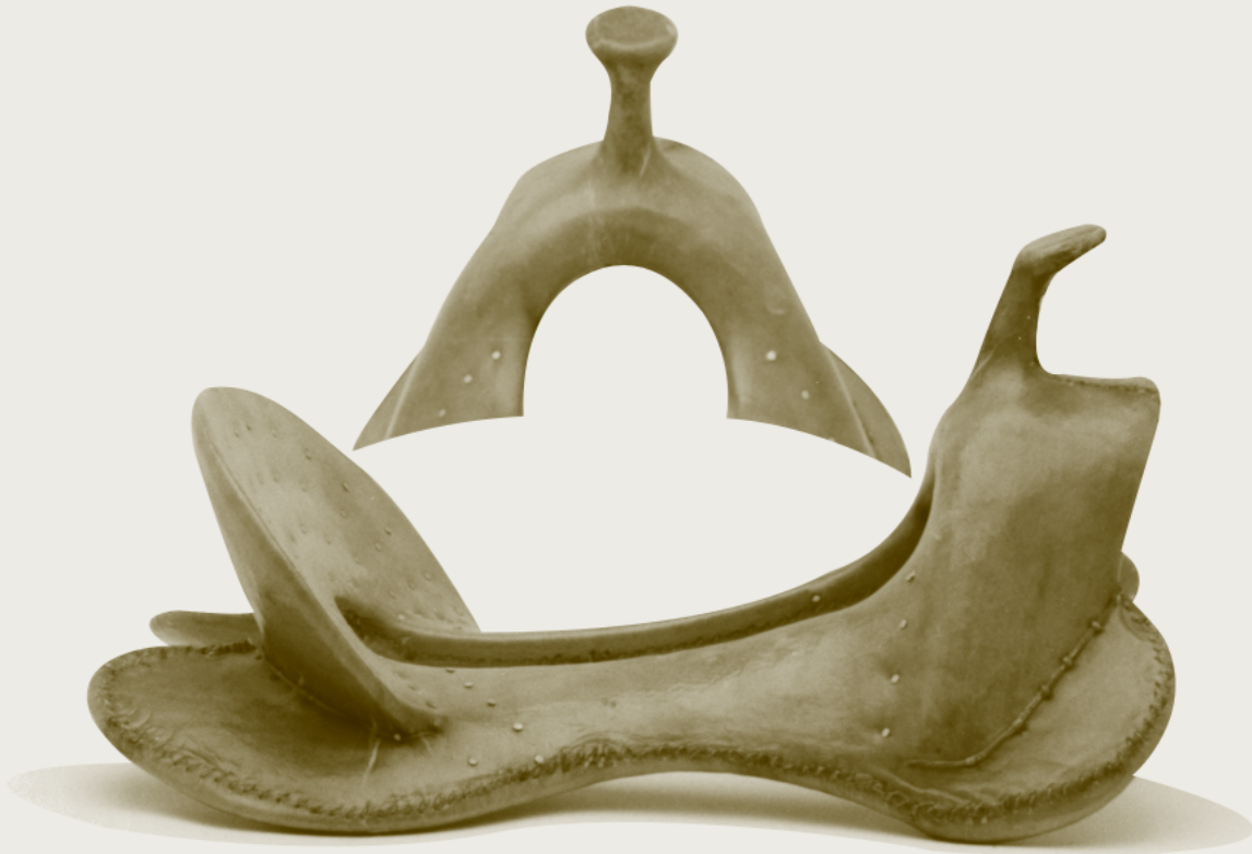
Old Time Slick Fork