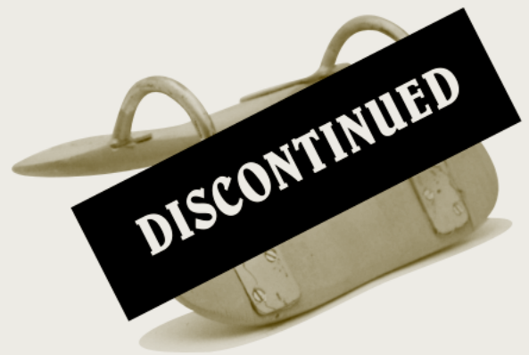
Decker Pack Tree