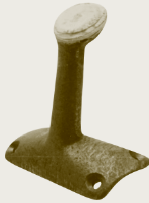
Cutting Horse CH 1 1/2" 4"✓ CH 1 1/2" 4 1/2"✓