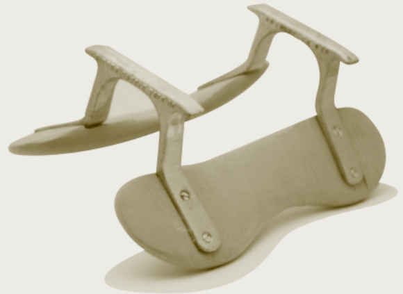
Bowden Pack tree