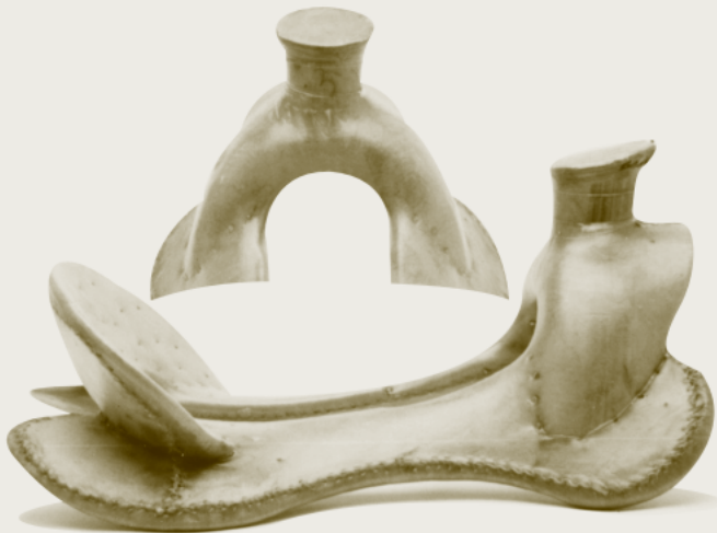
Cliff Wade Wood Post