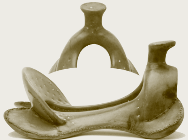
Snub Post Wade