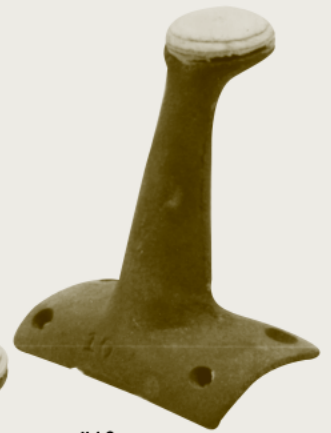
#10 1 1/2" Cap 4 1/4" High✓