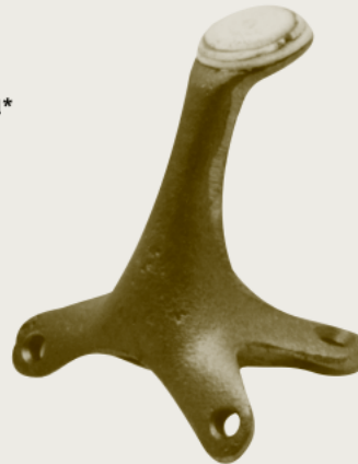
OD4 1 1/2" Cap 4" High✓