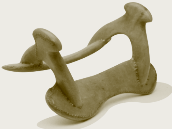
Ritter Pack Tree