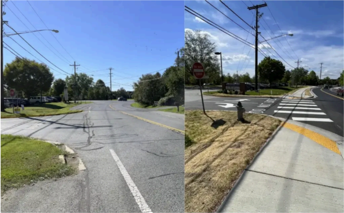
Travilah Elementary School

Published April 24, 2026 at 7:50AM | Updated April 24, 2026 at 8:18AM