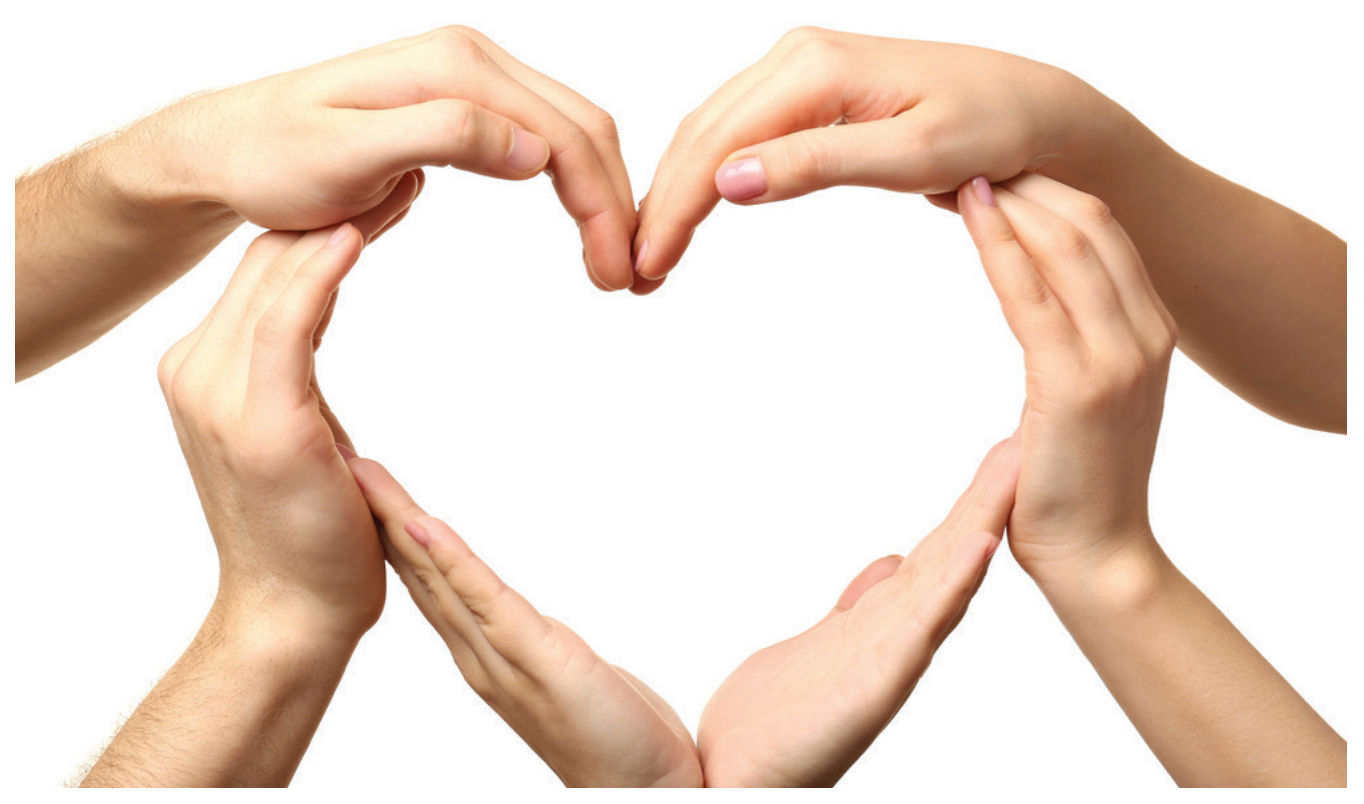
8 How to Develop Self-Compassion

"There is no need for temples, no need for complicated philosophies. My brain and my heart are my temples; my philosophy is kindness." – Dalai Lama