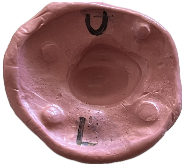
TOP MOLD WITHOUT EYE