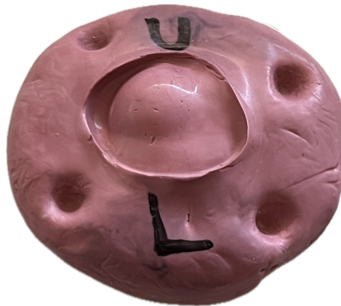
BOTTOM MOLD WITHOUT EYE