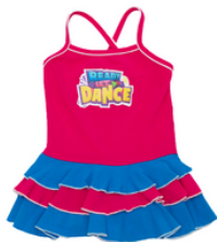
TUTU FRILL DRESS

All Ready Set Dance, students will be required to wear the official uniform that we are sure you will love. Below are the following options that can be purchased at reception.