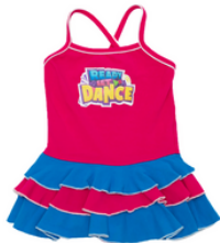
TUTU FRILL DRESS

All Ready Set Dance, students will be required to wear the official uniform that we are sure you will love. Below are the following options that can be purchased at reception.