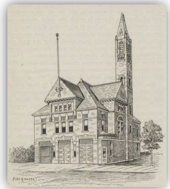
Fire Station Number 3 - Pen & Ink from Fire & Water Magazine