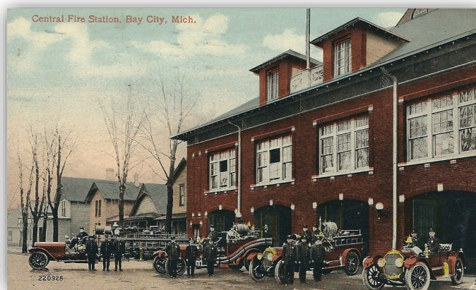
Bay City Central Station at McKinley & Adams (Moved from Old HQ near Washington & 4th)