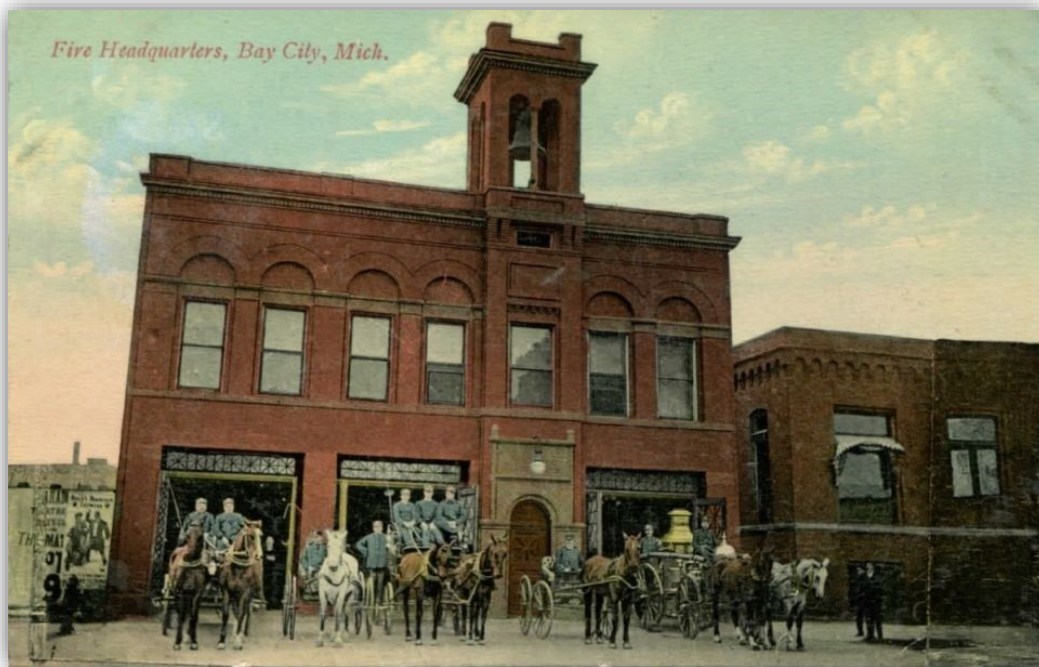
Original Horse Drawn Photo from Bay City HQ Fire Station. Station #1 was built in 1883.