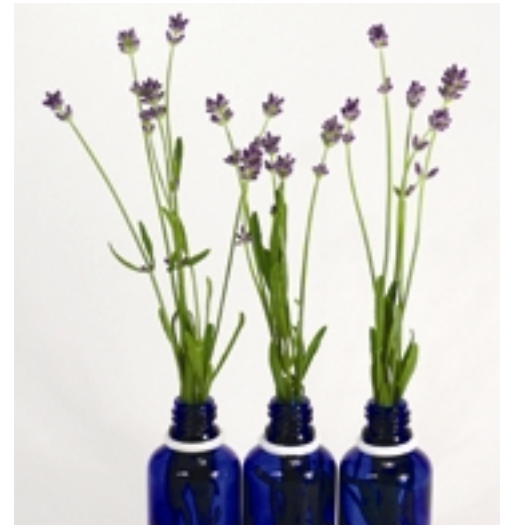
Lavender is loaded with wellness properties.