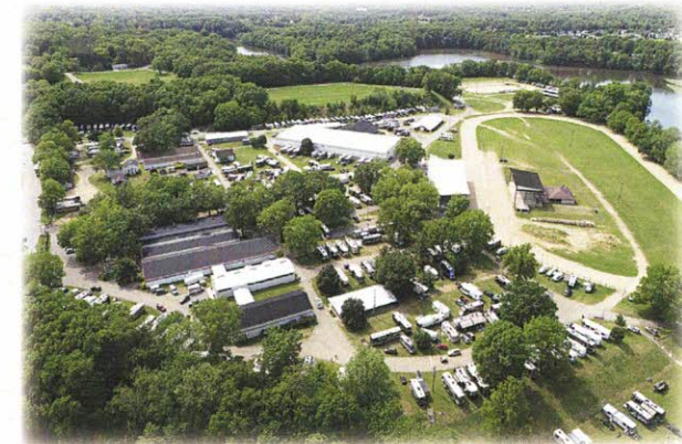
Family Motor Coach Association RV Rally pictured above