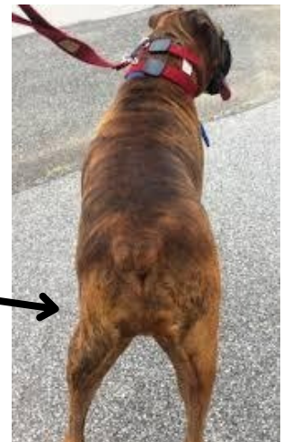
The canine patient pictured above is suffering from the thinning/wasting of muscles in the left hind limb.