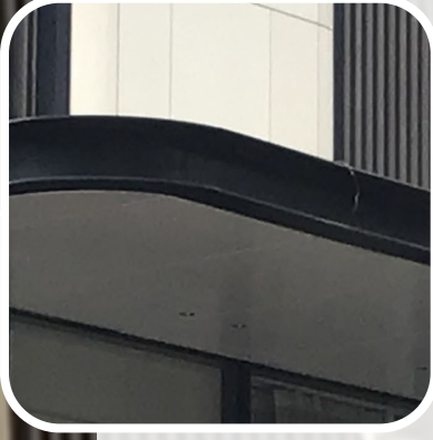
C - channels CNC cut and bent 12mm thick MS