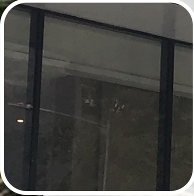
Cap curtain wall glazing with Laminated glass