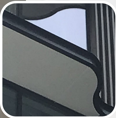
Customized CNC cut and Bent Solid Aluminum C Channel 4 mm thick