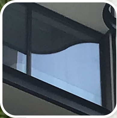
Windows with Schueco systems