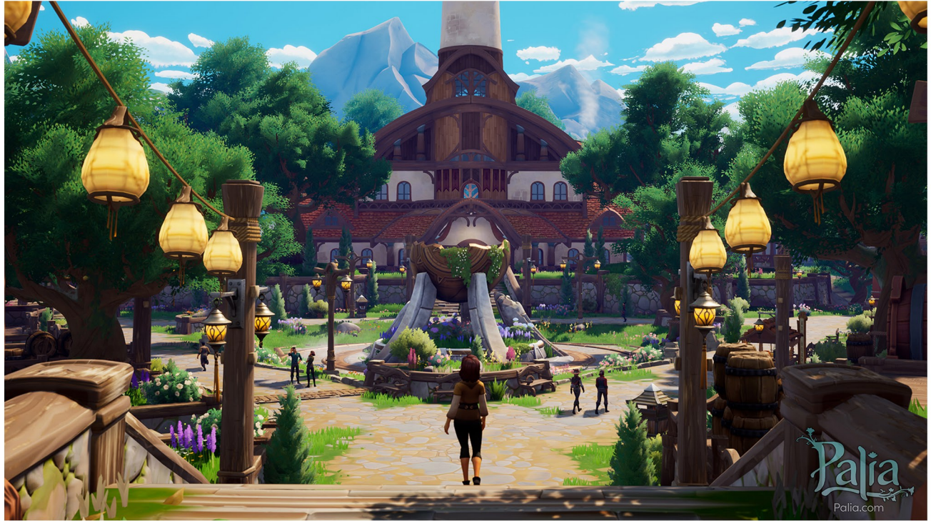
Kilima Village - Palia Announcement Trailer

This theme encompasses the peaceful tones of life during the day in Palia's Kilima Village. Originally composed for orchestra within the game, this theme has been arranged for piano so that musical members of our community can enjoy performing it. This was one of the first major themes I composed for the game and has a special place in my heart. I hope that this piece brightens anyone's day who performs or listens to it.