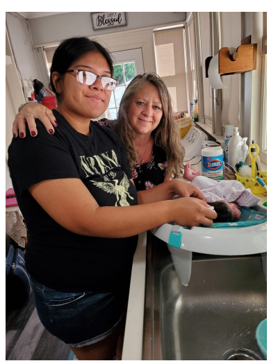
First bath by mommy. Mommy says, "Thank you for all the prayers."