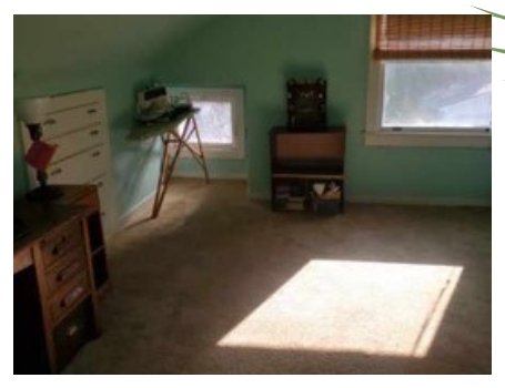
THE PICTURES ABOVE ARE TAKEN OF THE INTERIOR OF THE GABRIEL HOUSE