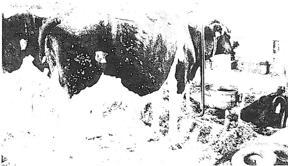
Figure 2. Cow with device in place. NOTE: the cow trainers in the barn were turned off for this study to prevent any exposures other than from the device.