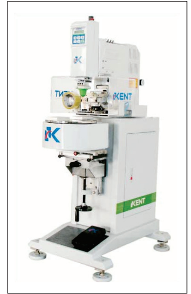
2-STATION WITH PNEUMATIC TURNTABLE