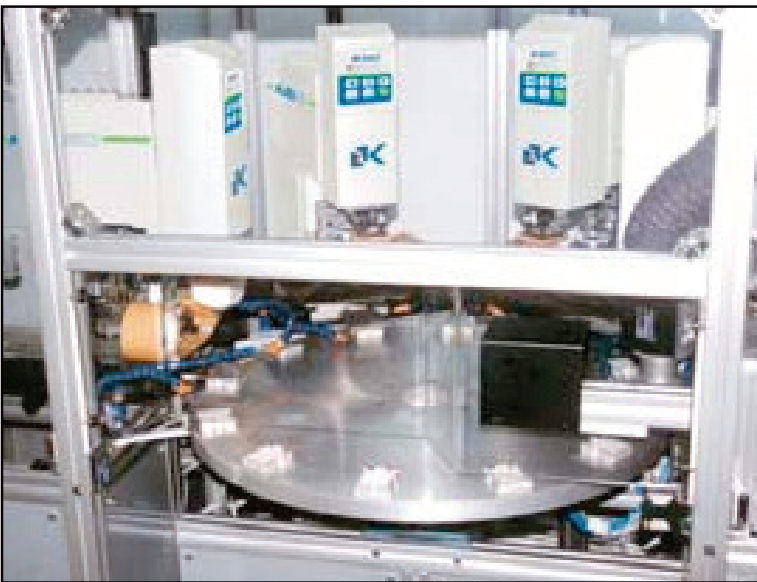
ALIEN ON TURNTABLE MULTI-COLOURS SET-UP