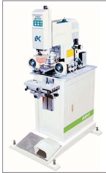
STAND-ALONE WITH AUTOMATIC PAD CLEAN