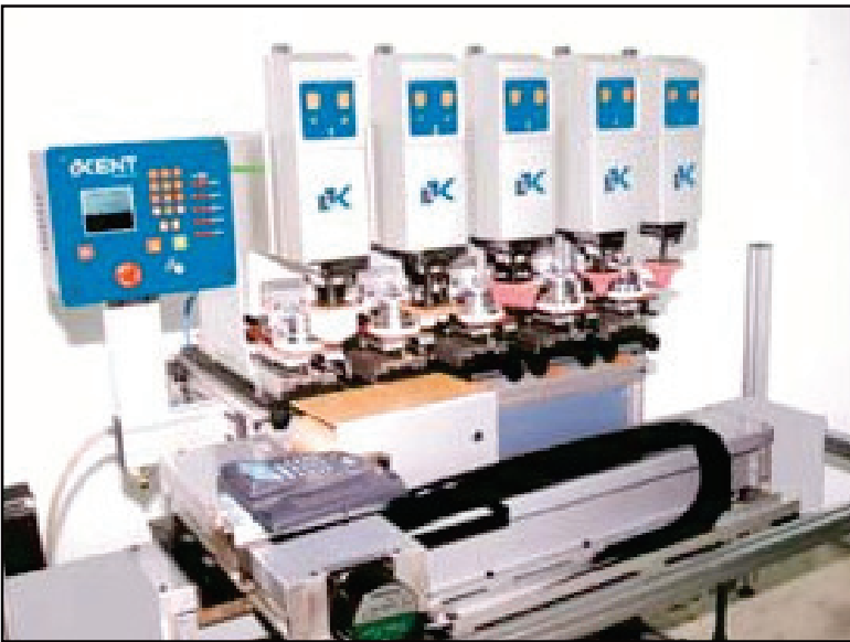
ALIEN IN-LINE MULTI-COLOURS SET-UP