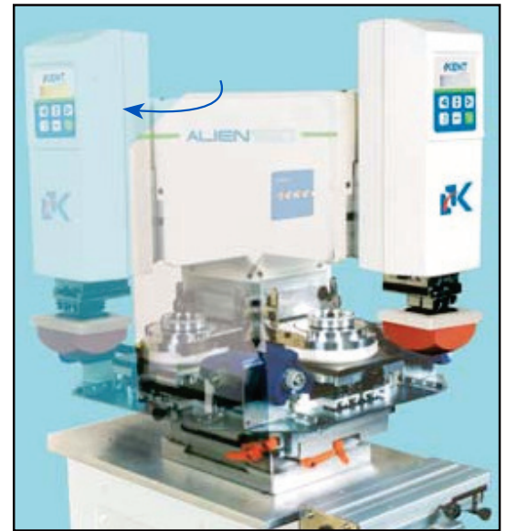
90 DEGREES TURNING ATTACHMENT FOR EASY PAD AND DIE PLATE CHANGE

NOTE: IMAGE MUST FIT WITHIN 4.5: DIAMETER COVERED BY THE INK CUP