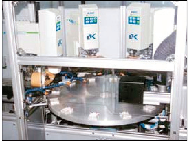
ALIEN ON TURNTABLE MULTI-COLOURS SET-UP