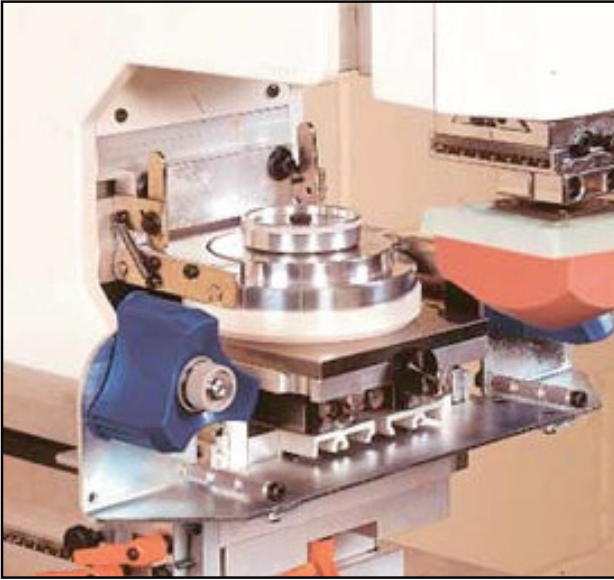
STAND-ALONE WITH PAD CLEAN SET-UP