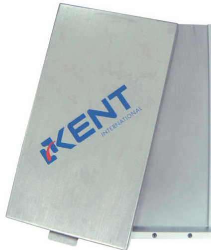
Table size: 180mm x 350mm (for \Phi 120, 130, 150 CMIC)

Table size: 150mm x 300mm (for \Phi 60, 70, 90 CMIC)