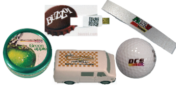
Ad Specialty Items