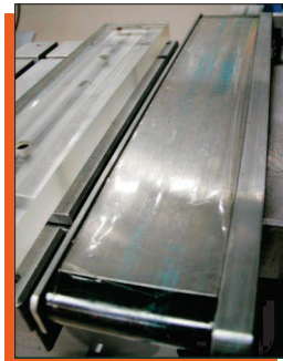
AUTOMATIC PAD CLEAN