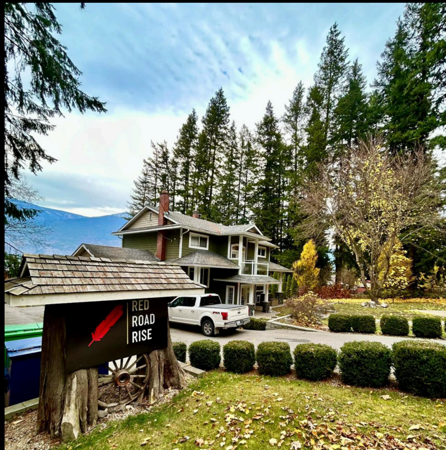
Red Road Rise SALMON ARM, BC

family recovery, coping skills, mindfulness, as well as the 12 step program. In addition, they will be engaging in our robust cultural programming that is facilitated by local elders and knowledge keepers including sweat lodge ceremonies, medicine wheel teachings, art therapy, smudging, spiritual guidance and much more.