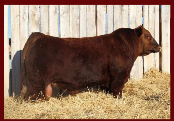
RED GOMACK REBEL 33J Sire of Lot 1 and 4