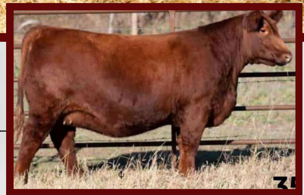
RED WHEEL MEG 31H Dam of Lot 3