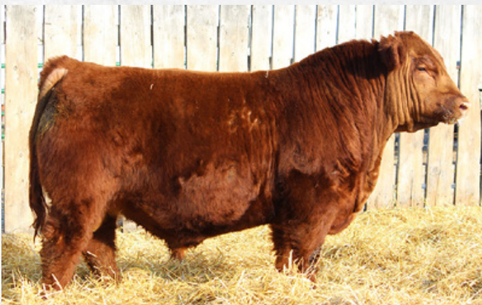
RED MRLA RESOURCE 137E SIRE OF LOT 17

This outcross bull has both his black dam and grandam with beautiful udders, and solid cows. His calves are amazing, both in pedigree and even more so phenotypically.