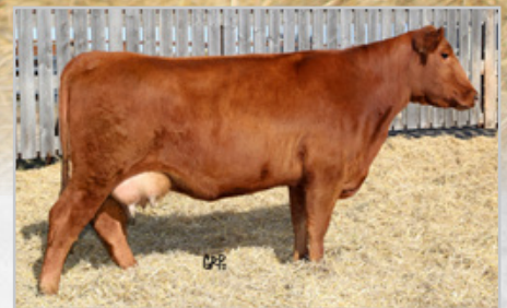
RED MKNZIE KURUBA 10A DAM OF LOT 17