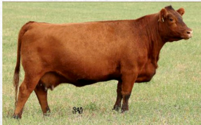
RED BRYLOR LULUWILL 128Z DAM OF LOT 16

Mar Mac Marshal 21F is a herd sire out of the famous Bonita cow family. This bull is loaded with maternal and paternal qualities.