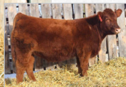
RED GOMACK WING 33F DAM OF LOT 8 AS A CALF