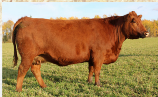
RED MKNZIE CHERO 74B DAM OF LOT 1

Red Gomack Rebel 33J has calving specialist written all over him, from his pedigree, to his strong muscular frame, smooth shoulders, and length. Rebel grabs a lot of attention where ever he goes sitting on perfect feet. Being structurally sound, he is the Ultimate calving ease Bull. His sire Ice Man 260D had dependable, proven calving ease and an outcross pedigree. Combined with a Cheroviann Dam 74B, the ultimate cow family dating over 50+ years, no wonder he has extra- performance and is incredible. Don't miss out on this opportunity to add consistent calving ease, structurally sound genetics to your herd. CAN & US Qualified