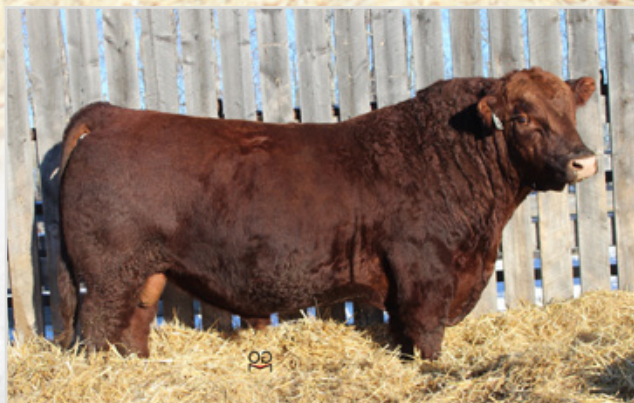
RED RSL ICE MAN 260D SIRE OF LOT 1