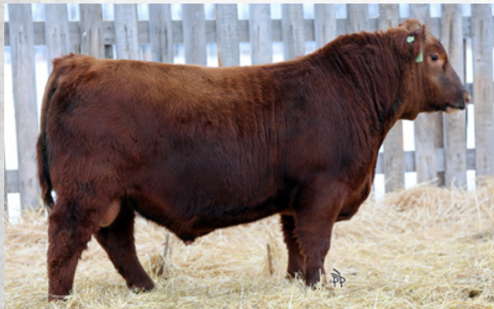
RED MAR MAC MARSHALL 21F SIRE OF LOT 16

Mar Mac Marshal 21F is a herd sire out of the famous Bonita cow family. This bull is loaded with maternal and paternal qualities.