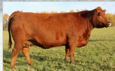
RED MKNZIE CHERO 74B DAM OF LOT 2