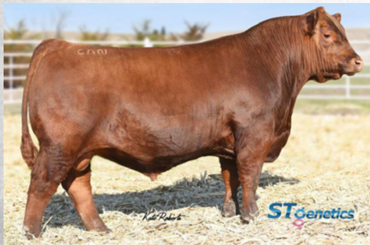
RED U2 DOMINION SIRE OF RED GOMACK POLAR EXPRESS 1H

Polar Express 1H has always stood out to everyone that has stopped by. He stood out with his stout, easy fleshing, muscular frame right from birth. His progeny are following right behind, they all have his Top line that is wide and goes forever. He also follows his sire Red U2 Dominion, an outcross bull offering maternal value and incredible phenotype. His Dam Anexa 468A is from arguably one of the very top female families in the Red Angus Breed, a Breed Influencer, proven to succeed. With this combination he was a definite herd sire, to which we used him for 2 years and are very impressed. We would love to keep him around longer but being a registered breeder we need to keep our genetics rotating, so this is an amazing opportunity to grab a young herd sire. If you want to add natural thickness to your calves, make sure you take a Polar Express home today!!!