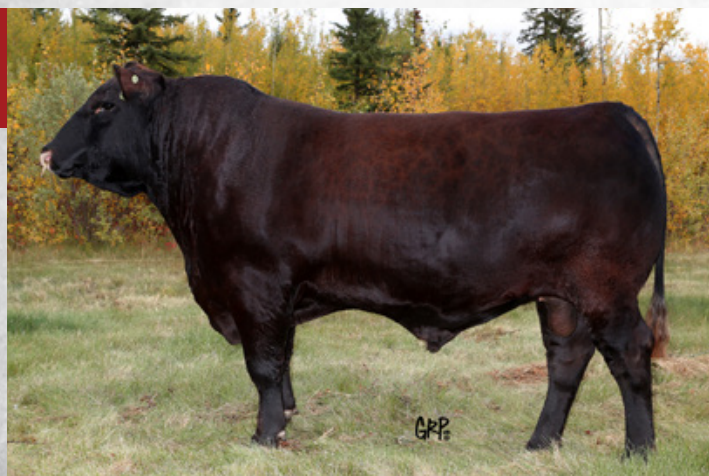
RED GOMACK KING DIAMOND 1B MATERNAL SIBLING TO RED GOMACK IRON CUT 33H