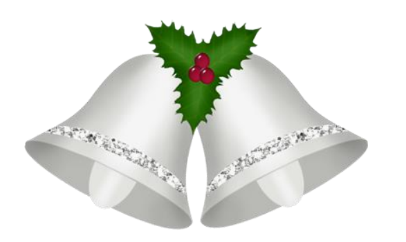
Christmas Eve Service at 6:30 pm

December 17 *** 9-10am *** Fellowship Hall