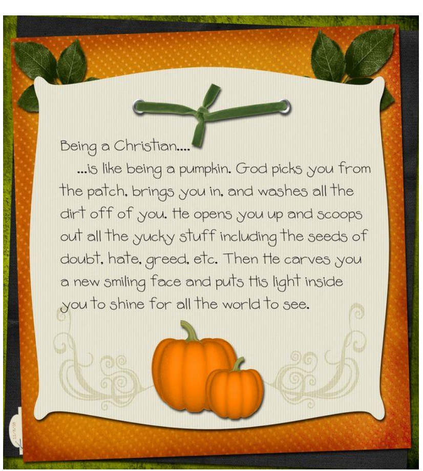
For God, who commanded the light to shine out of darkness, hath shined in our hearts, to give the light of the knowledge of the glory of God in the face of Jesus Christ. 2 CORINTHIANS 4:6 KIV

THE CARVER GAVE ME HIS LIGHT INSIDE! AND HE CAN DO IT FOR YOU, TOO!