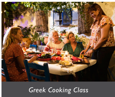
Greek Cooking Class