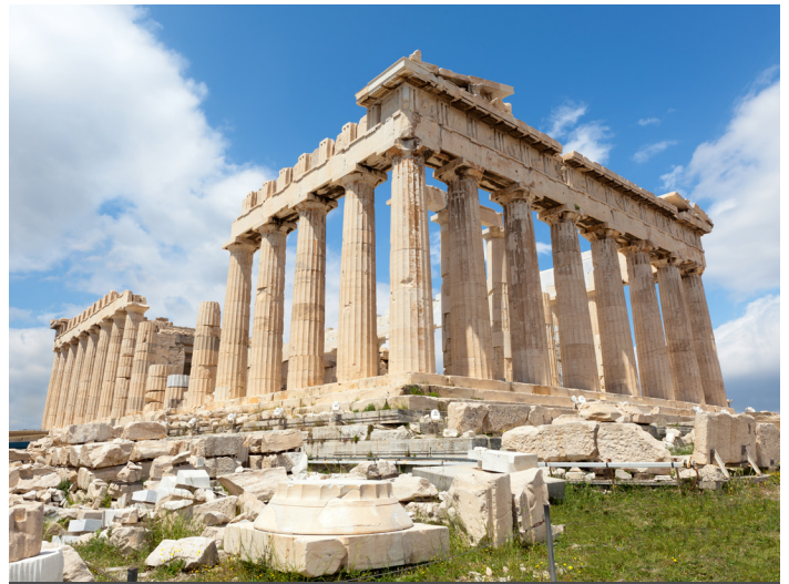
Temple Parthenon at the Acropolis

Visit the Temple of Olympian Zeus , once a colossal tribute to Olympus' king.